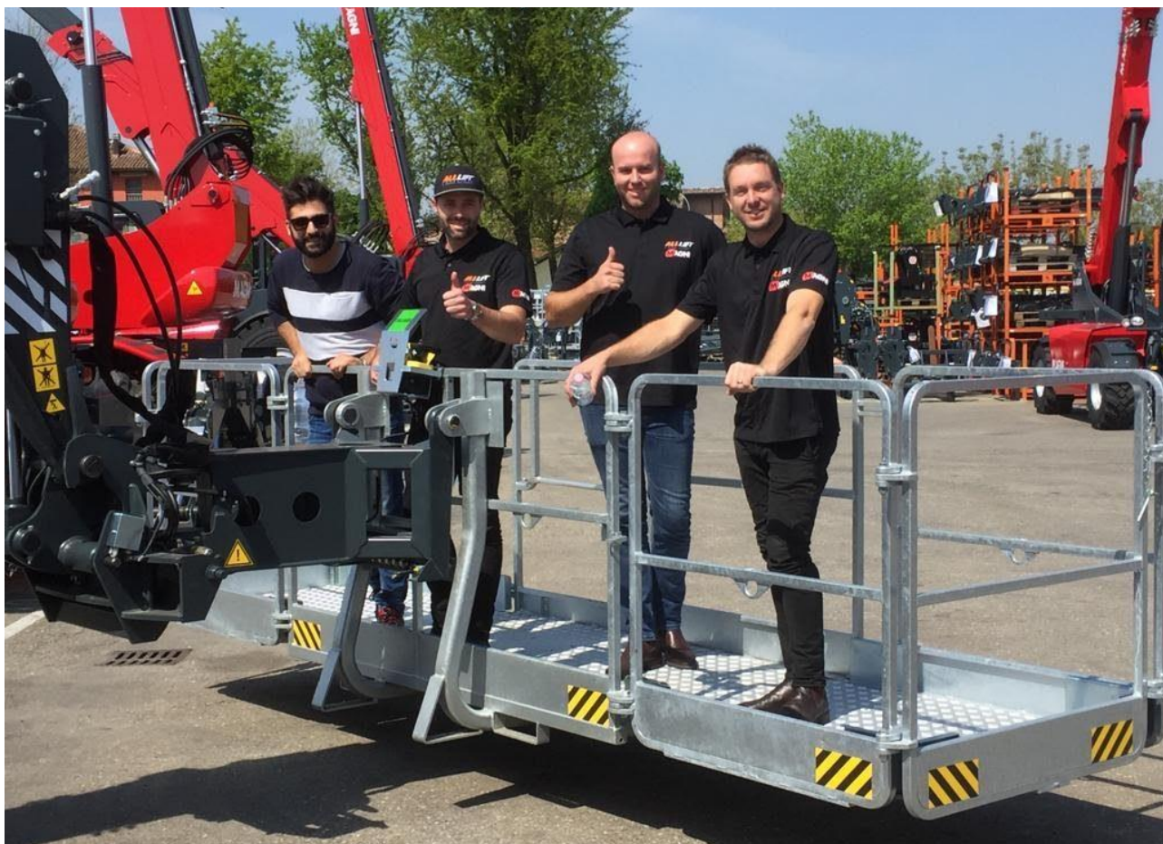
The All Lift Forklifts and Access Equipment team giving the thumbs up for the Magni brand.

They have a brand new design with integrated diagnostics, touch-screen control display and a full-visibility cab. Magni only use quality parts and components, so it's no wonder they're currently the #2 telehandler brand in sales worldwide for the RTH models already." Dean added.