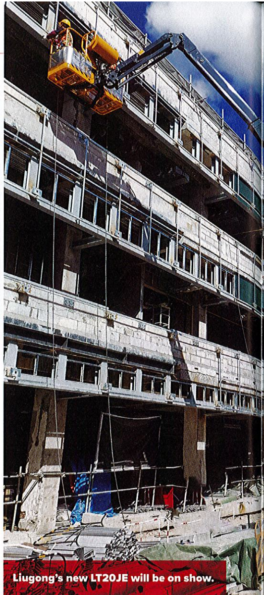
Liugong's new LT20JE will be on show.

MAGNI will showcase the latest range of articulated and telescopic boom lifts built through its partnership with Dingli.